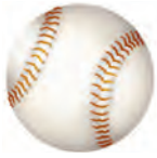
2. a baseball