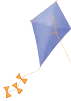
3. a kite