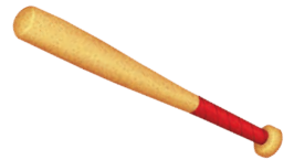
10. a bat