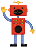
6. a robot