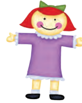
4. a doll