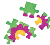
9. a puzzle