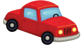
5. a car