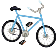
7. a bicycle